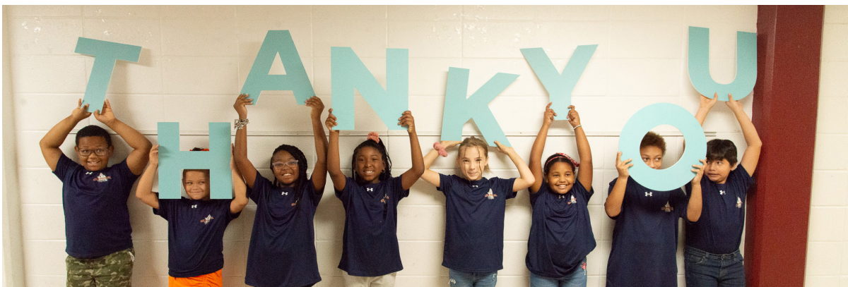
In Anniston, Alabama, Golden Springs Elementary students show their appreciation for the new STEM Center.